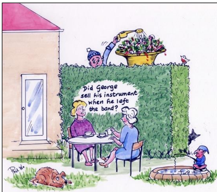
Thanks to Phil Woodford for another fabulous cartoon