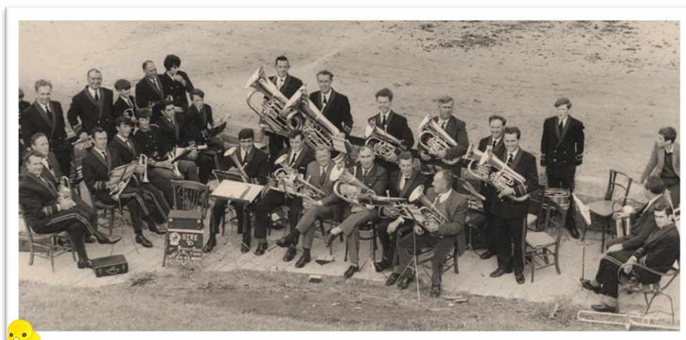
(Rushen Silver Band circa 1966, photo taken at Happy Valley, PSM)